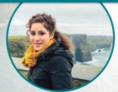
CLIFFS OF MOHER WHICH OVERLOOK THE OCEAN.

For inquiries and reservations, please contact: