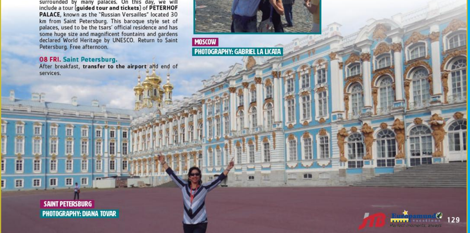
SAINT PETERSBURG

Print your final list of hotels in your "My trip" website. Ask your travel agent