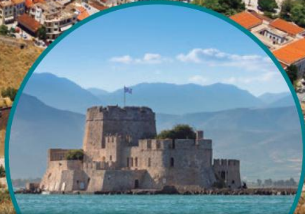
NAFLIO A TOWN BY THE AEGEAN SEA.