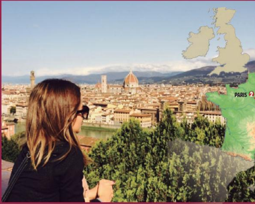
FLORENCE PHOTOGRAPHY: DAYANN FALLAS